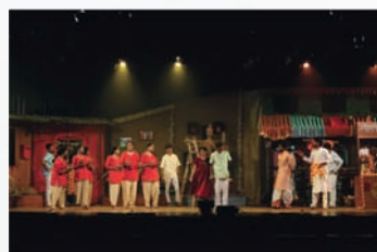
Team Kalangan: Finalist in Firodiya Karandak