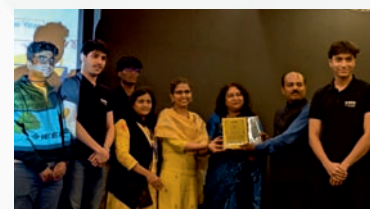
IEEE Student Branch of the year Award