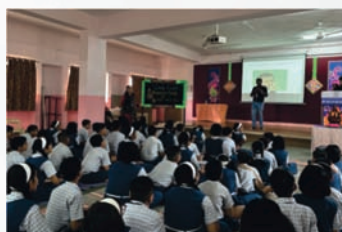
Techno Social Awareness Activities