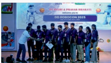
Team Robocon: Best Report Award