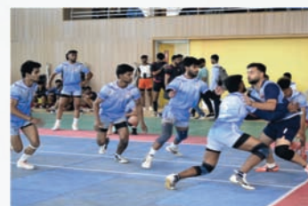
Kabaddi Team: National Level Winner