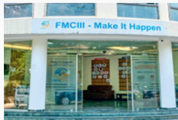
FMCIII: Startup Wall