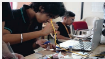
Toycathon 2026: 24-Hour National Level Hackathon