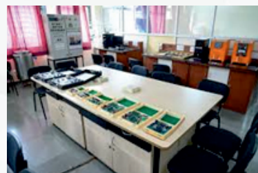
Automation and Control Lab