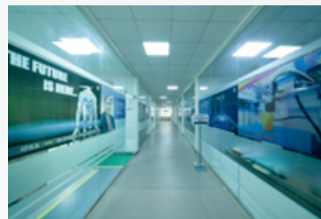
State of the Art Infrastructure