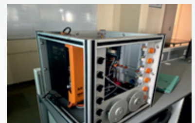
Advanced Embedded and Signal Processing Lab