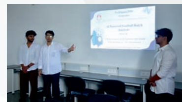
TechSpark 2k26: Students Symposium