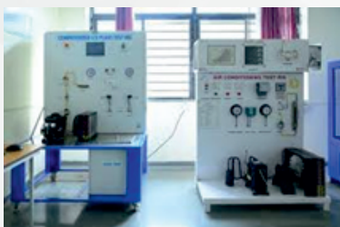
Refrigeration and Air Conditioning Lab