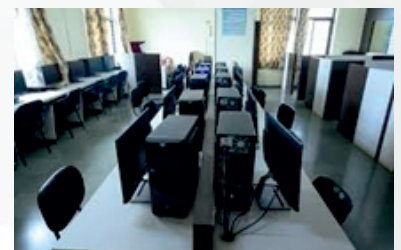
Augmented Reality & Virtual Reality Lab