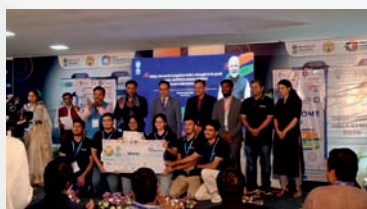
SIH Hackathon Winner