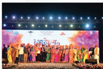
Ensemble 2k26 : Aarohan: Annual Social Gathering