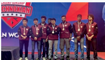
Technoxian World Robotics Championship: Drone Race - World Rank 3 & AIR 2