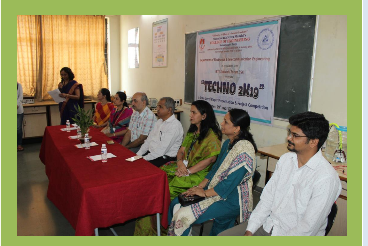
Inauguration Ceremony of TECHNO2K19