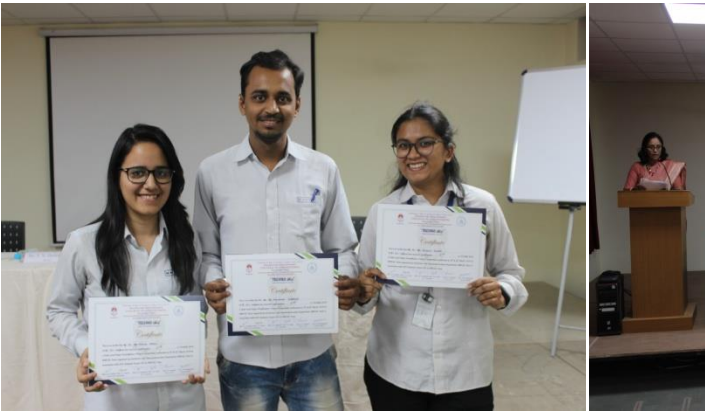
Winners of Paper Presentation