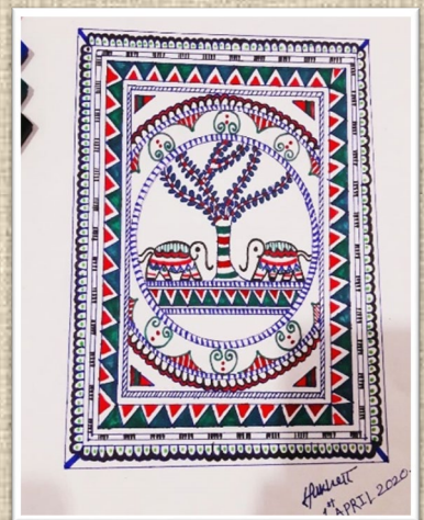
Beautiful Madhubani art by Sukhada Dole (TE)