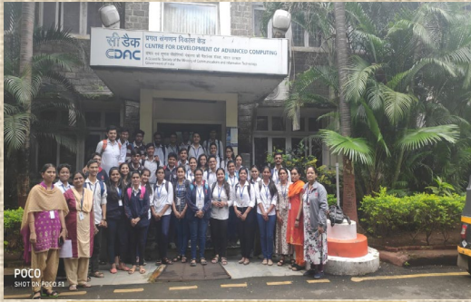
Industry Visit – CDAC, SPPU.