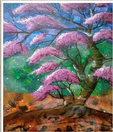
Shades of nature Shruti More (TE)