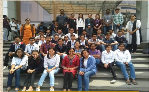
Industry Visit – Persistent, Hinjewadi.