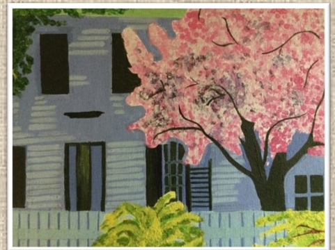
An abstract landscape Akshita Shinde (TE)