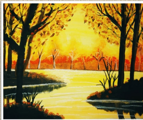
Golden hues of nature Shweta Kothawade (TE)