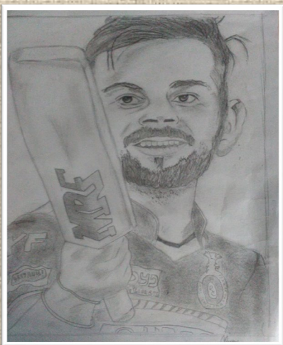
Outstanding sketch of Virat Kohli by Chinmay Dunakhe (TE)