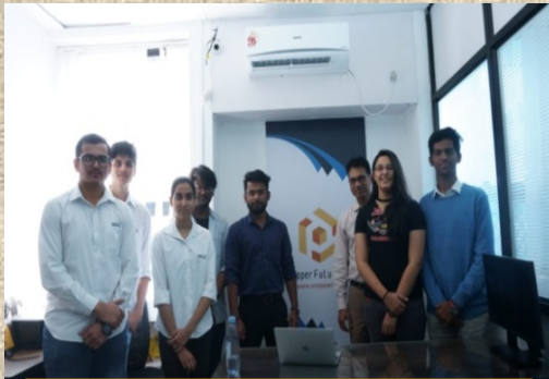
Industry Visit – Snapper Future Tech.