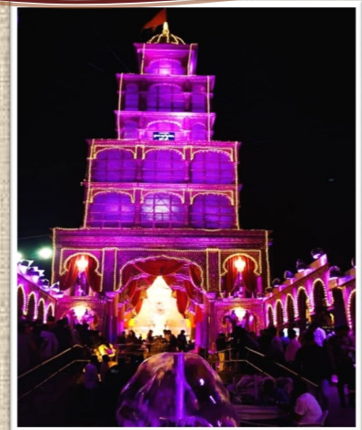
Beautiful lighting at temple Omkar Shep (TE)