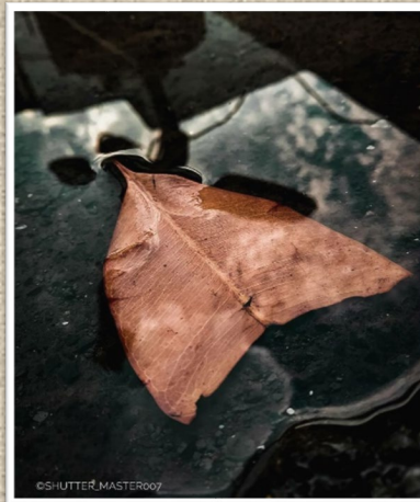
After effect of Rainfall!!! Sushant Warwate (TE)