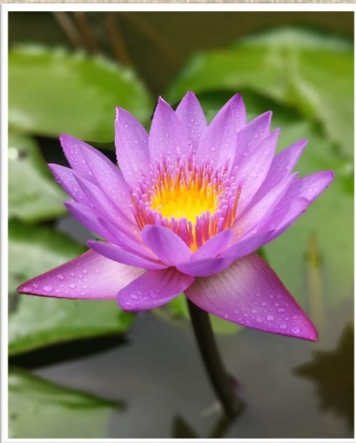
Lotus at Ganpati temple Pratik Rughe (TE)