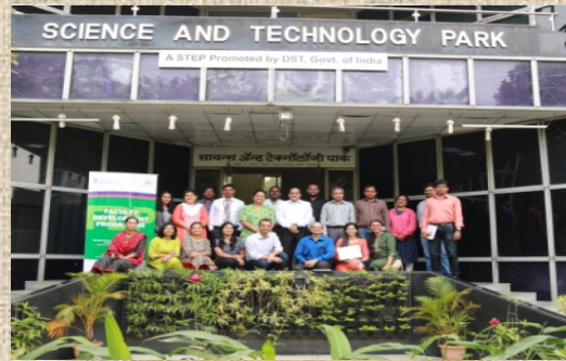
FDP in Entrepreneurship