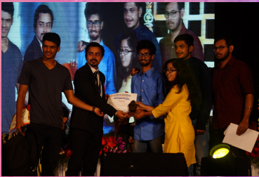
Dexterity 2k17 winners