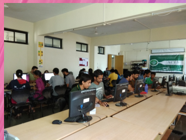
TE Project Competition