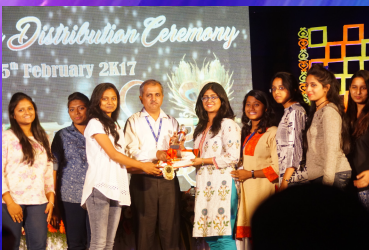
BE (Comp) Girls Dodgeball winners