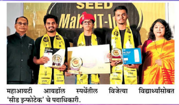
Seed IT Idol