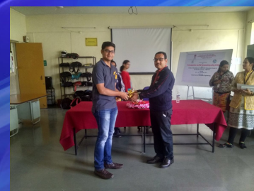
Best Participant in Introduction to GPU Computing using CUDA