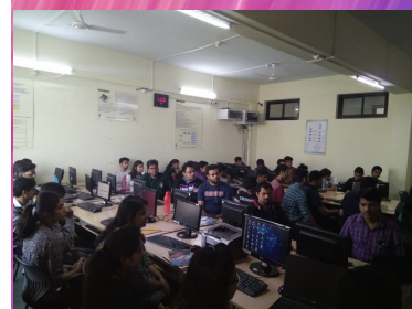
CUDA Computing Workshop