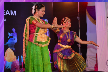
Cultural Contribution of Comp Department