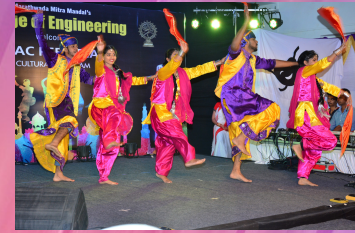
Cultural Contribution of Comp Department