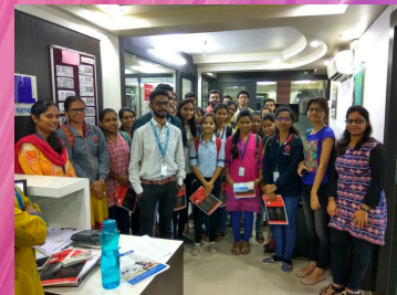
NITS Global visit