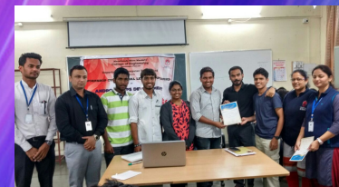
Android App Development under UTKRAANTI 2017