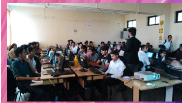
Ethical Hacking and Cyber Security Workshop