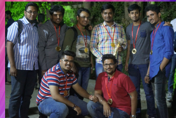
BE (Comp) Tug of War winners.