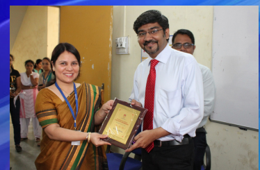
Inauguration of Digital Forensic Research & Development Lab