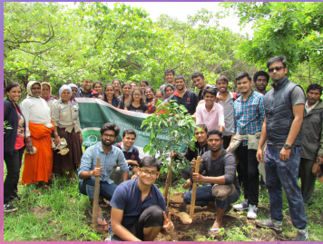
Aadhar Club at Taljai Hills