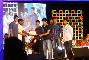
BE(Comp) Football Winners