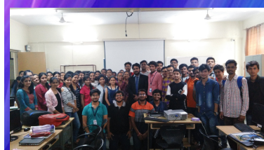
Ethical Hacking Workshop