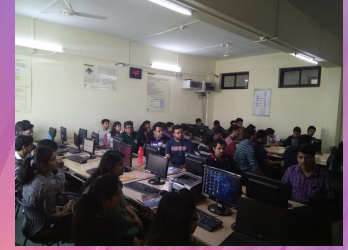
Workshop on GPU Computing using CUDA