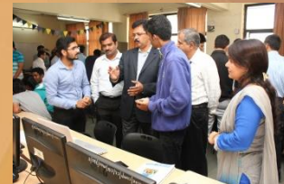
Project Demonstration under Centre of Innovation