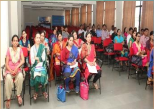
Faculties of Various Dept. attending FDP on Entrepreneurship Development