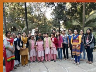
The Poona School & Home for Blind Girls