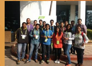
NVIDIA GTCx Conference