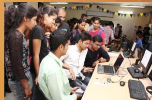
Project Demonstration under Centre of Innovation