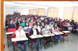
Big Data & Hadoop Ecosystem Workshop