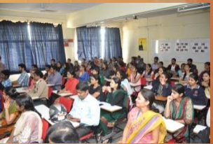
Workshop on Cyber Security