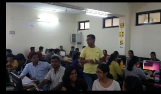
B.E. Students Conducting RAIBHA