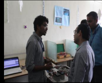
Center of Innovation