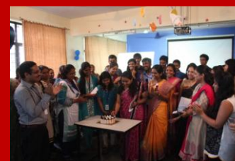
Teacher's Day Celebration