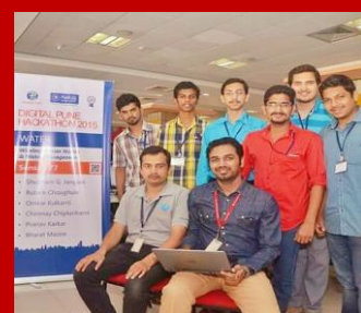
Persistent Digital Hackathon 2015