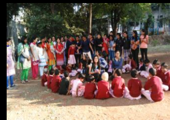
AADHAR-Providing a helping hand.