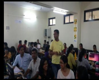
B.E. Students conducting Hadoop Workshop