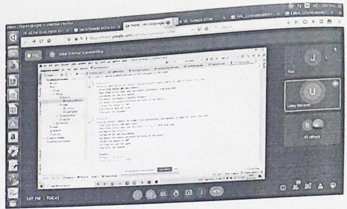
Selenium WebDriver Demonstration